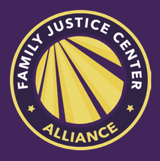
150+ Family Justice Centers in the U.S.

69 Affiliates of The Family Justice Center Alliance and are committed to best practices