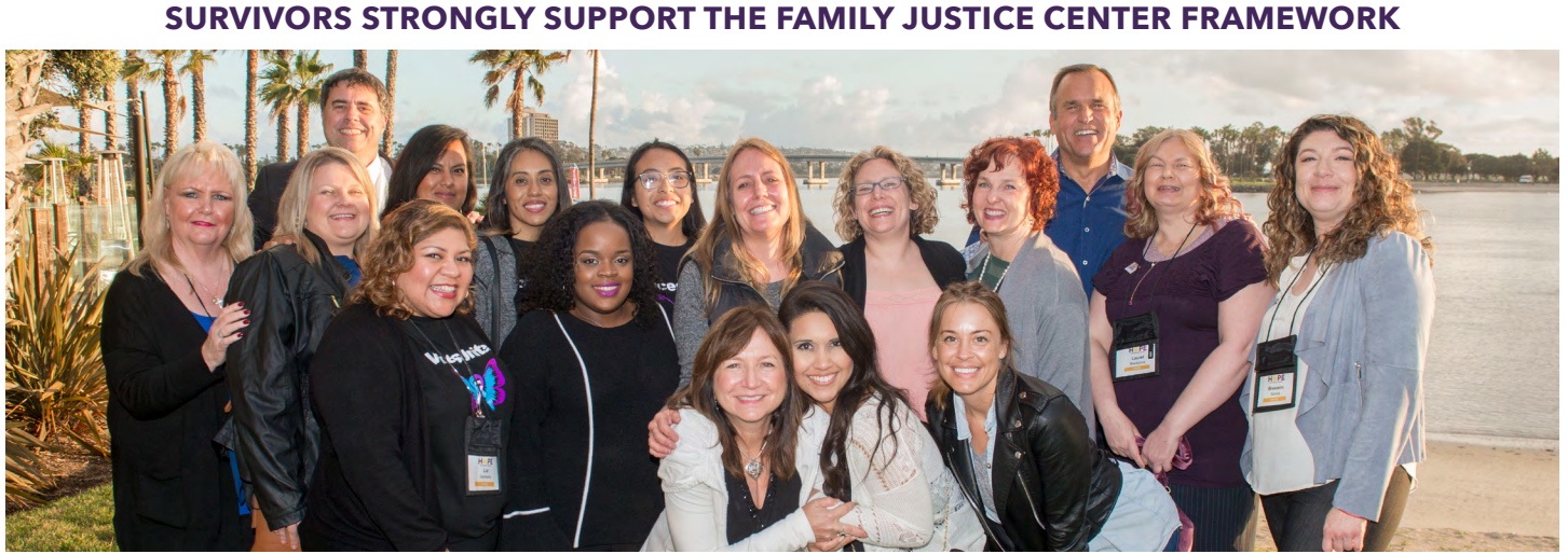
National VOICES Survivor group with members representing 35 VOICES Chapters located around the United States.

SURVIVOR RESEARCH: More than 230 focus groups conducted in communities planning Family Justice Centers, 100% of survivors of