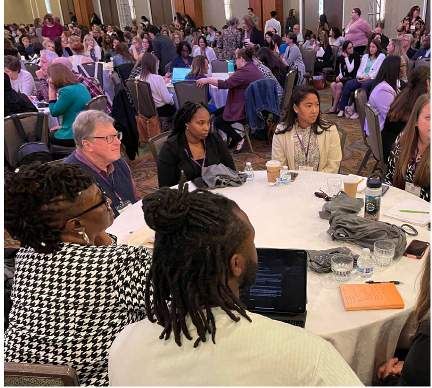
Participants at the 24th Annual International Family Justice Center Conference in May, 2024.