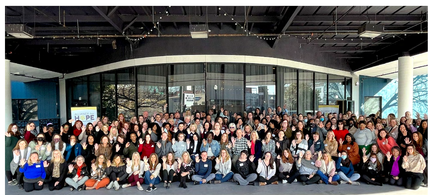
12th Annual Leadership Summit - Family Safety Center, Nashville, Tennessee in December, 2021.