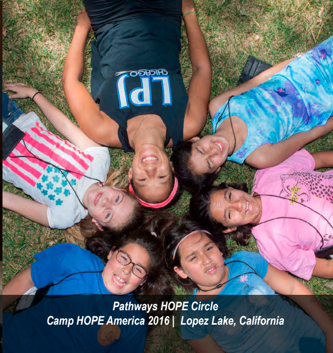
Pathways HOPE Circle Camp HOPE America 2016 | Lopez Lake, California