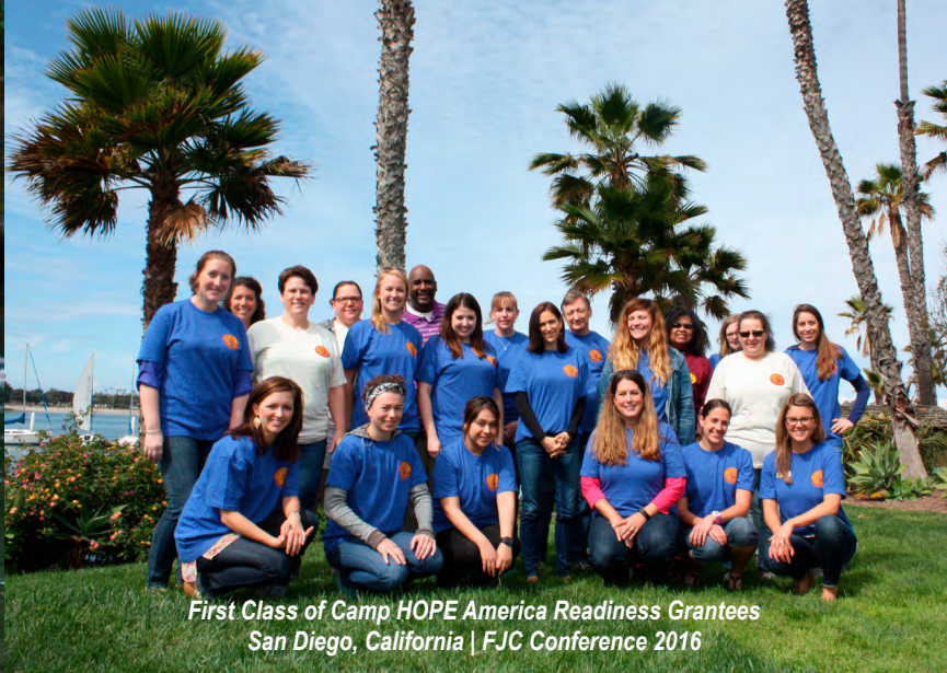
First Class of Camp HOPE America Readiness Grantees San Diego, California | FJC Conference 2016