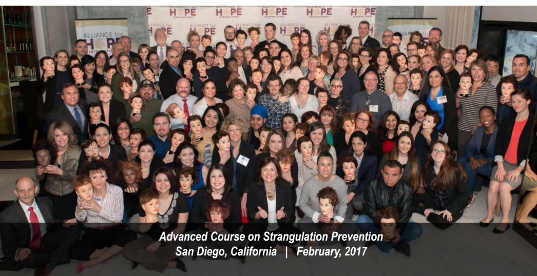
Advanced Course on Strangulation Prevention San Diego, California | February, 2017