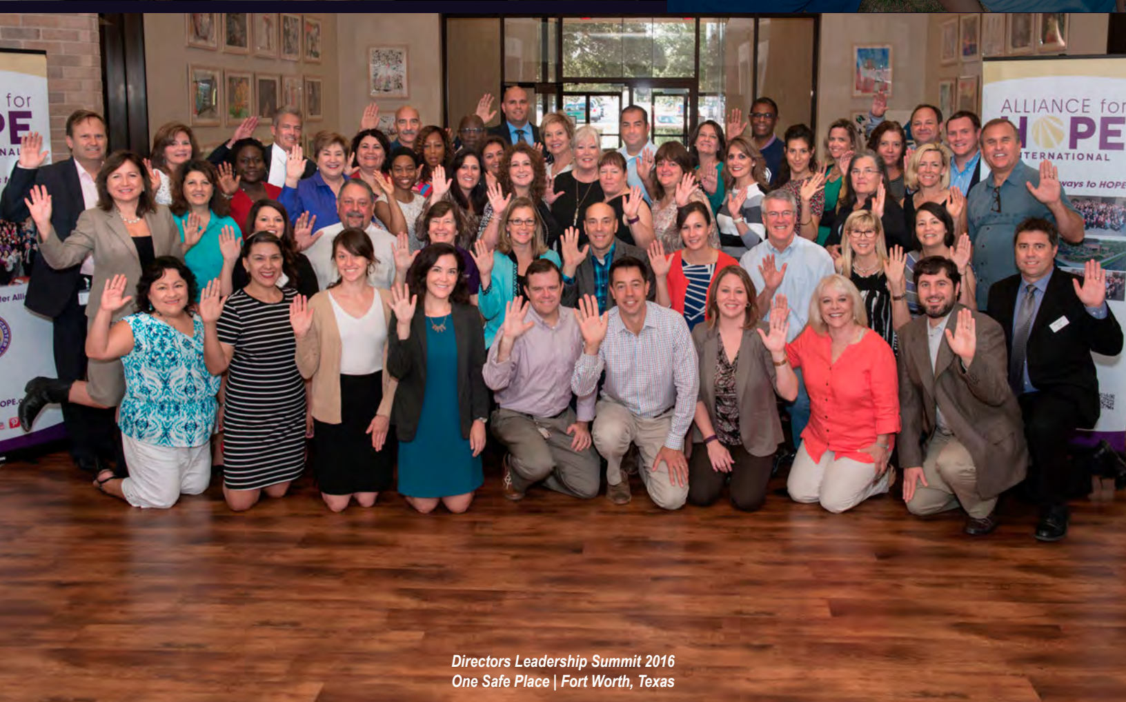
Directors Leadership Summit 2016 One Safe Place | Fort Worth, Texas