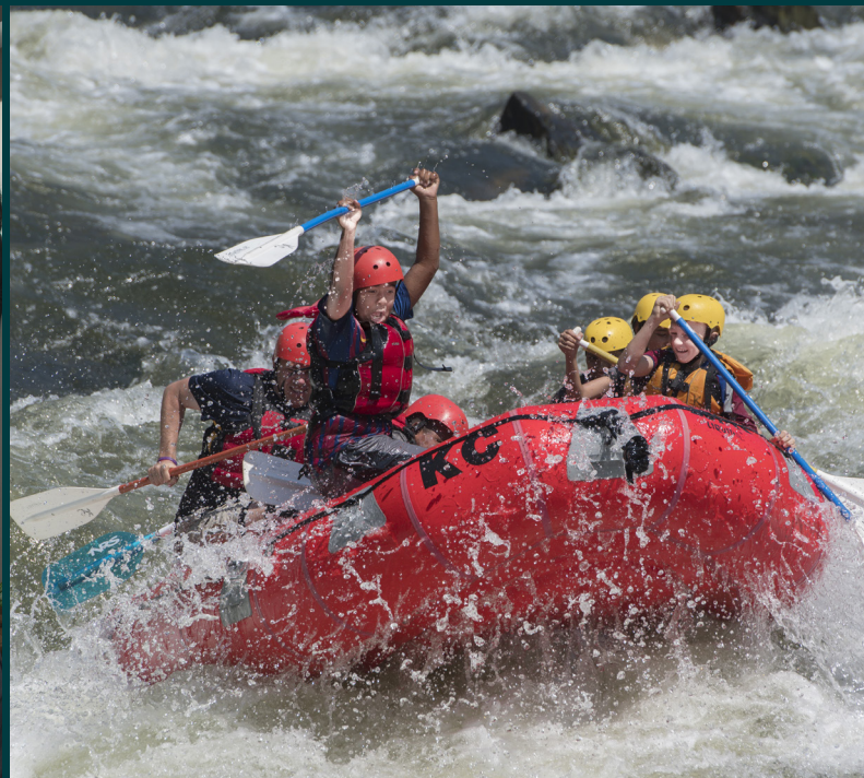
Camp HOPE America Klamath River, Northern California | July 2017