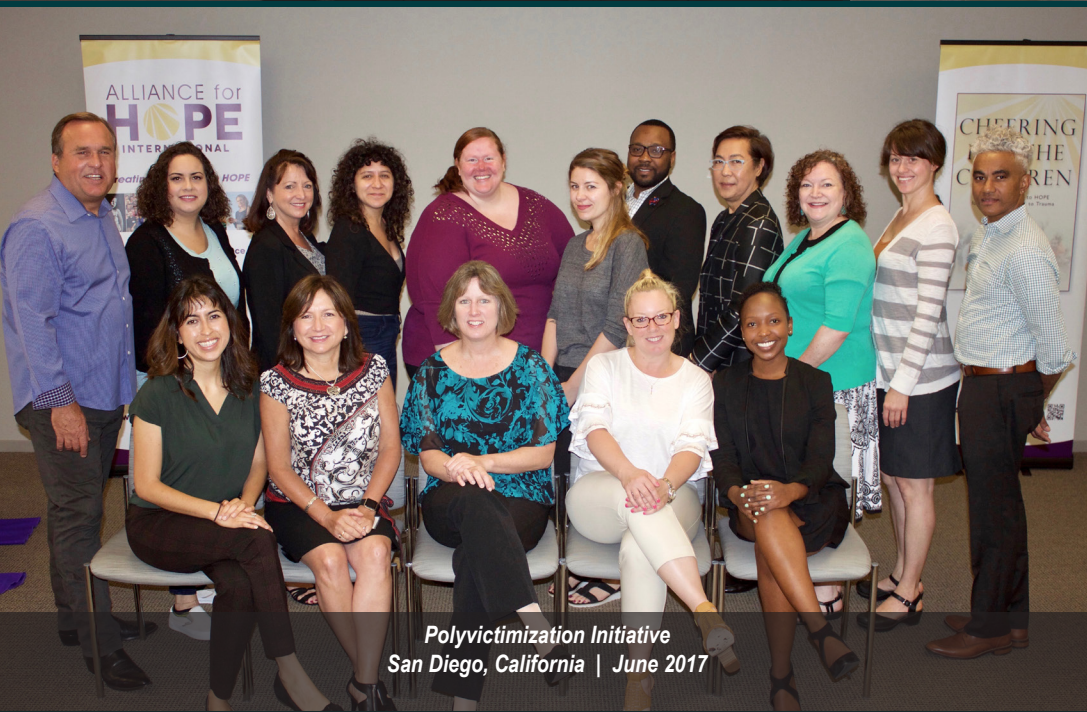
Polyvictimization Initiative San Diego, California | June 2017