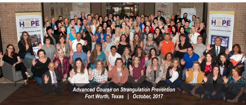
Advanced Course on Strangulation Prevention Fort Worth, Texas | October, 2017