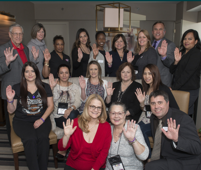
VOICES Survivor Network and Alliance for HOPE International Staff and Board International Family Justice Center Conference | April 2017