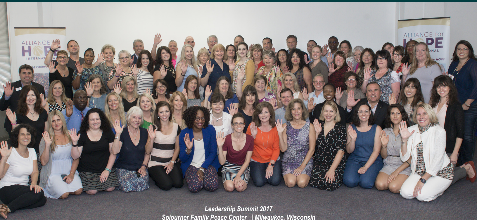
Leadership Summit 2017 Sojourner Family Peace Center | Milwaukee, Wisconsin