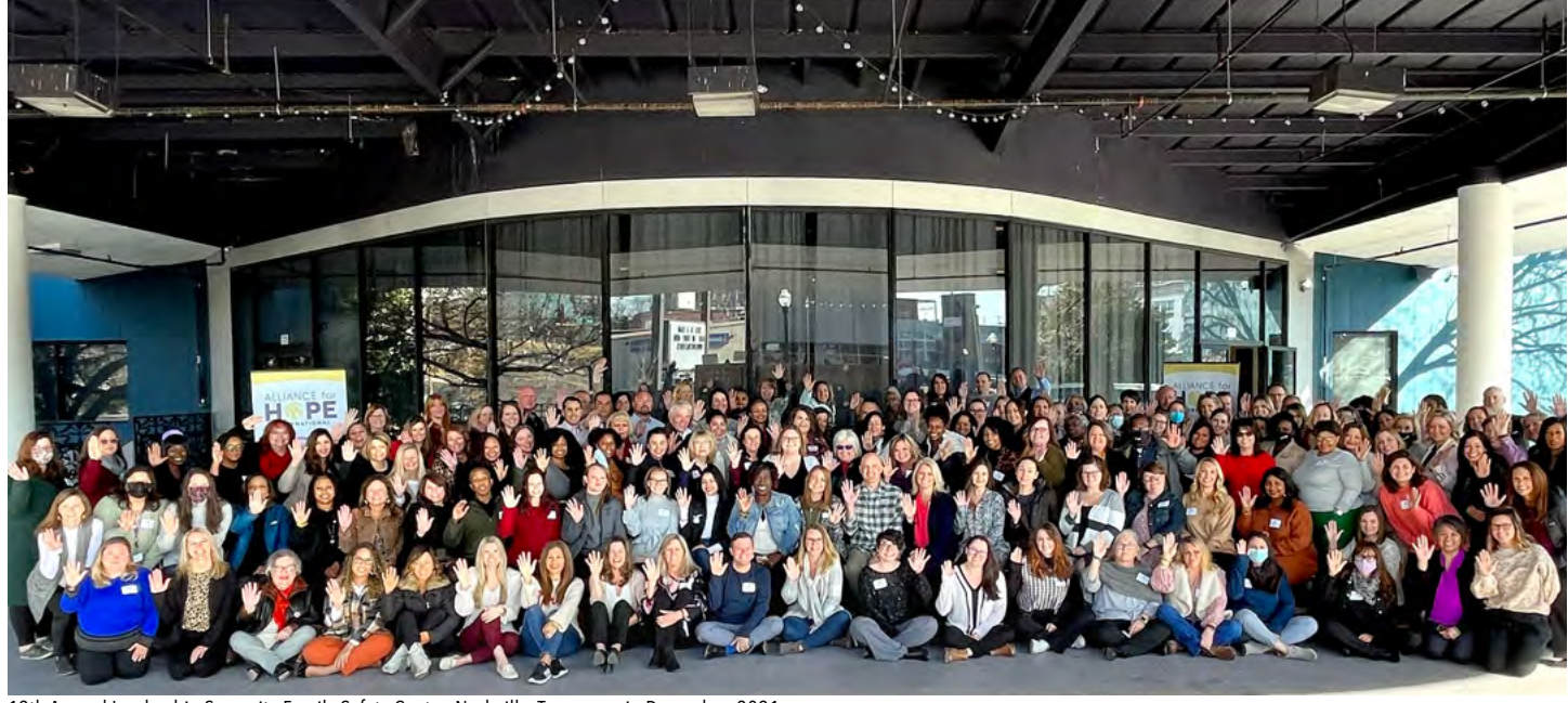
12th Annual Leadership Summit - Family Safety Center, Nashville, Tennessee in December, 2021.