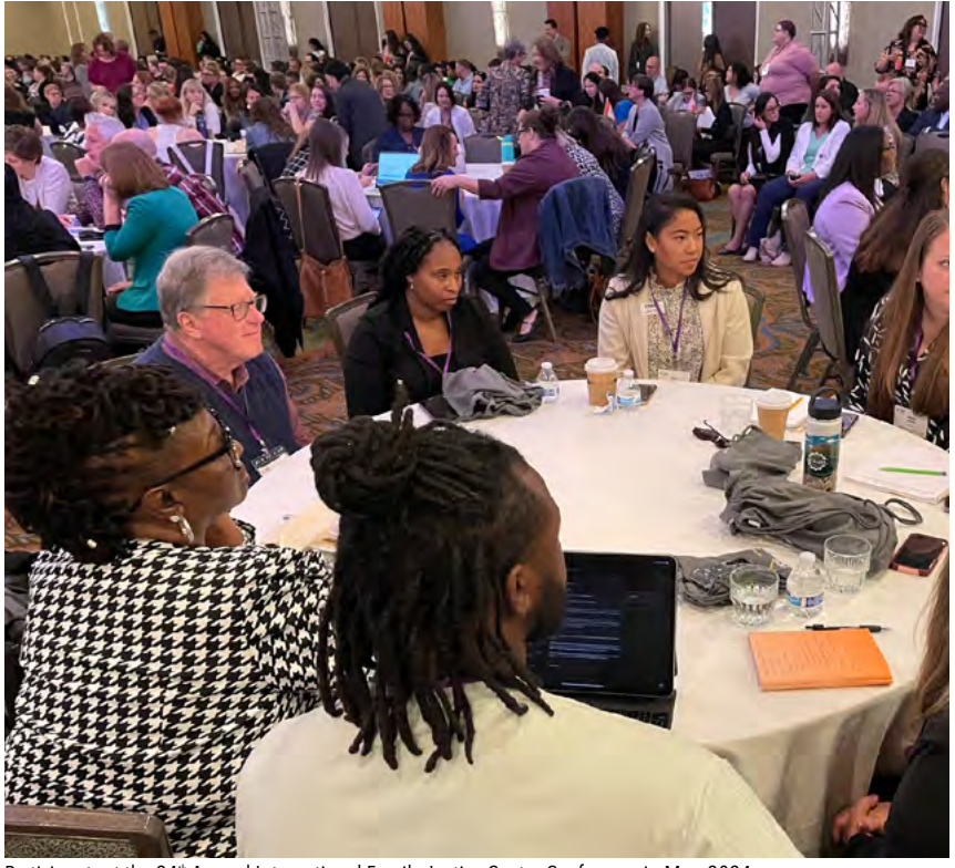
Participants at the 24th Annual International Family Justice Center Conference in May, 2024.