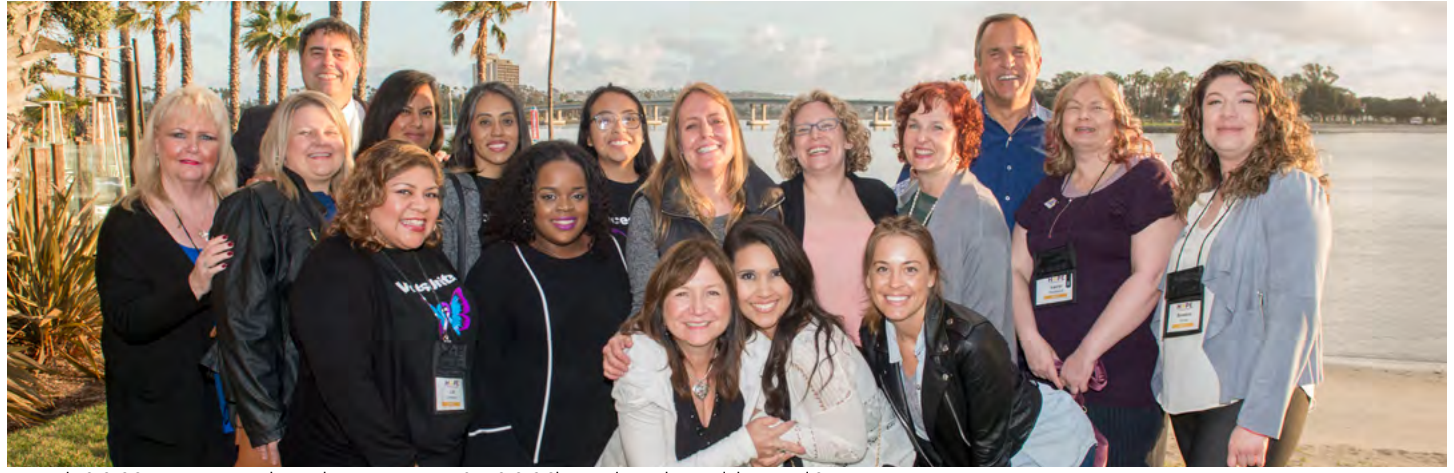
National VOICES Survivor group with members representing 35 VOICES Chapters located around the United States.

SURVIVOR RESEARCH: More than 230 focus groups conducted in communities planning Family Justice Centers, 100% of survivors of